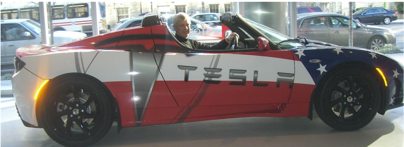
Figure 1 The first Tesla Electric Roadster

Tesla is an all-electric high performance automobile introduced in 2003 to a market that was probably not yet ready for it.